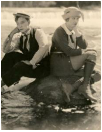
Eames - Parade (1935)